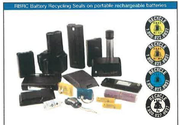
RBRC Battery Recycling Seals on portable rechargeable batteries

Liquid paint (LATEX ONLY) can be hardened or solidified and discarded in your regular trash. An effective way to dry out latex paint is to mix oil dry or clay catbox filler with the liquid paint (approx. 1:1 ratio) and allow it to dry out. Seal containers and place inside a plastic trash bag and set inside your trash container. Try to limit the number of cans you place out at one time. Please make sure that children and animals cannot get into the paint.